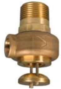
Series 953 Emitter

Using proprietary supersonic technology, the system atomizes the water to <math><10\mu\text{m}</math> forming a dense homogeneous suspension of nitrogen and water. In this manner two extinguishment mechanisms are occurring simultaneously: cooling and oxygen reduction.