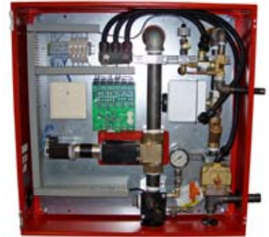
Series 951 Addressable Combination Box