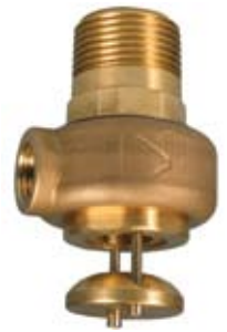
Series 953 Emitter

Using proprietary supersonic technology, the system atomizes the water to <10µm forming a dense homogeneous suspension of nitrogen and water. In this manner two extinguishment mechanisms are occurring simultaneously: cooling and oxygen reduction.